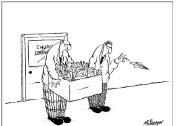
"Remind me never to ask the Youth Group to help fold the church bulletins again."